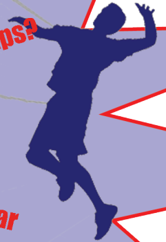
TABLE TOP EXHIBIT OF INDUSTRY VENDORS GREAT BBQ! ... DJ... DOOR PRIZES... BOUNCE HOUSE FOR THE KIDS!!! ALL INDUSTRY ALLIES ARE CORDIALLY INVITED TO ATTEND.. ELECTRICAL CONTRACTORS & PERSONNEL, ELECTRICAL INSPECTORS, ELECTRICAL ENGINEERS, MANUFACTURERS REPS, DISTRIBUTORS, WHOLESALE SUPPLY PERSONNEL...

Tug-of-War Can Your Team Pull it's Weight?